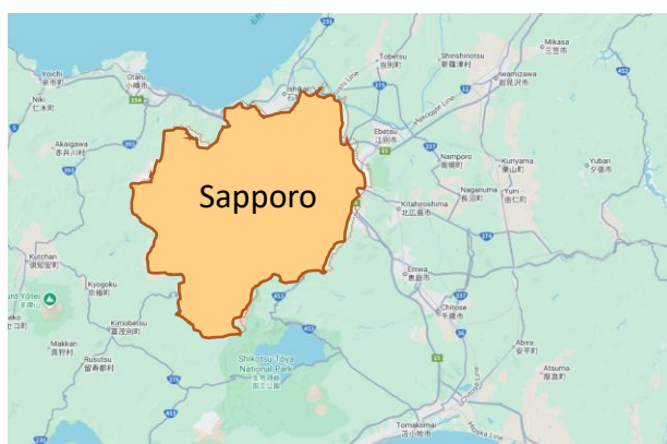
Location of Sapporo